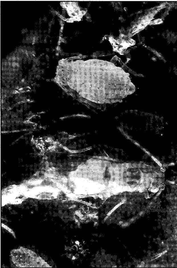
Figure 3. Crape myrtle aphids.