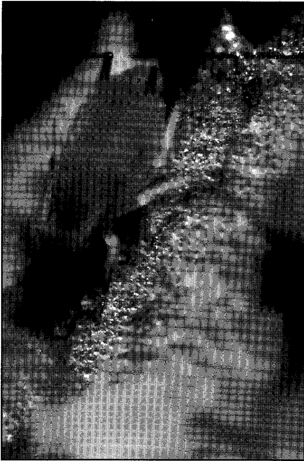
Figure 1. Cotton or melon aphid.

they can be active year-round. In the spring, winged females fly to suitable host plants and produce live nymphs through parthenogenesis. Nymphs develop through several stages (instars) before becoming mostly wingless adults in 4 to 10 days, depending on the temperature. Winged adults are produced when certain environmental conditions occur. Many overlapping generations can occur each year.