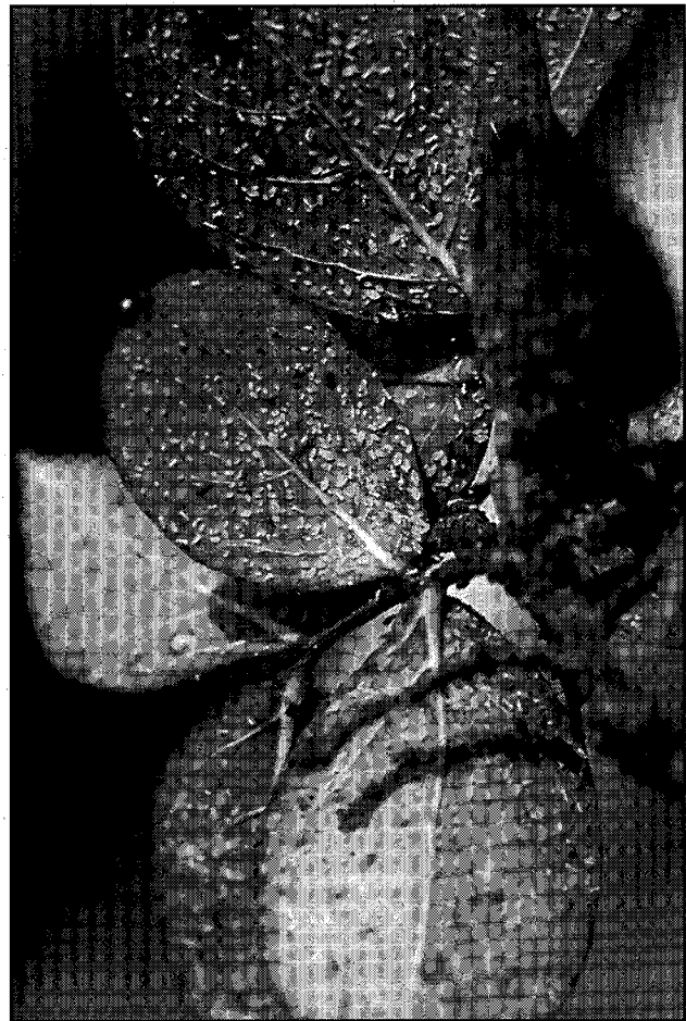
Figure 4. Crape myrtle aphids.

Habitat and food sources. This aphid specifically infests crape myrtle. Much of the sap withdrawn from the plant is directly eliminated as honeydew, which becomes infested with sooty mold, producing a dry-looking