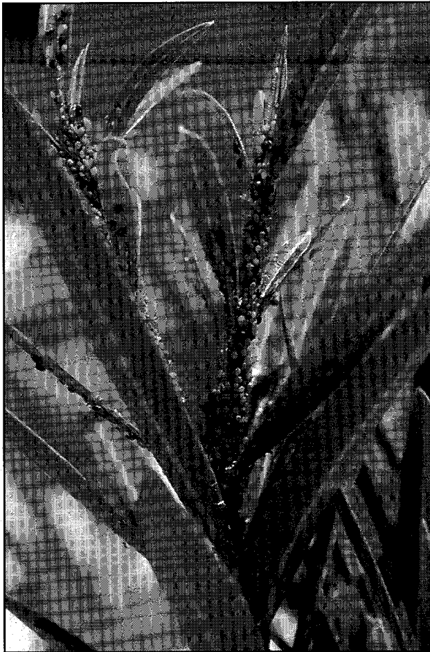
Figure 5. Oleander aphids.

plant health, although their high numbers and the accumulation of sooty mold associated with honeydew can be a nuisance and unsightly. In most cases, many oleander aphids become infested with a parasitic wasp, Lysiphlebus testaceipes (Cresson). Infested, or parasitized, aphids swell, turn brown, and die. The wasp cuts a hole in the back of the aphid's abdomen to emerge.