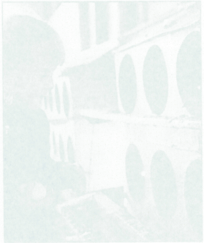
Typical nests for the small laying flock.

Nesting material such as straw or hay should be placed in the nests and replaced frequently to keep eggs clean. Collect eggs twice daily and cool them rapidly to preserve egg quality. Store eggs small end down.