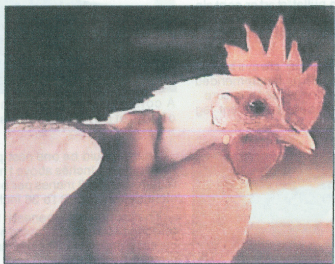
A good quality Leghorn type hen in early production.

Chicks should have 1 square foot of floor space per bird. Put at least 4 inches of litter on the floor of the cleaned, disinfected pen or house. Never place chicks on a slick surface such as cardboard, plastic or newspaper. Wood shavings, cane fiber, ground corn cobs, peanut hulls or rice hulls make good litter. Hay makes very poor litter and should not be used. Stir the litter weekly with a hoe to prevent packing.