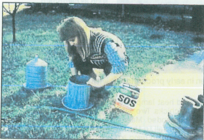
Good health is dependent on clean, potable water.

Clean, potable water and feed must always be available. Add poultry vitamins, at the recommended level, to the drinking water the first week to ensure that birds have sufficient vitamins and to prevent leg problems.